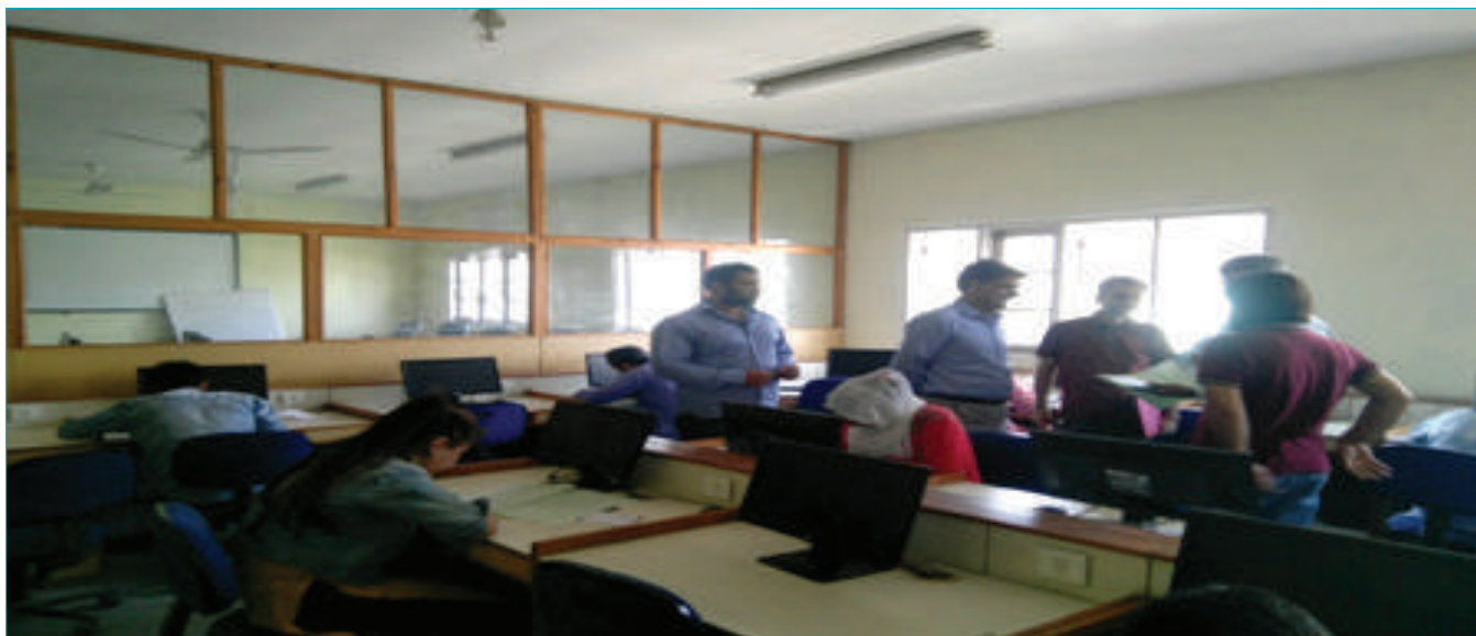
Cluster University Srinagar conducting written test for various posts.