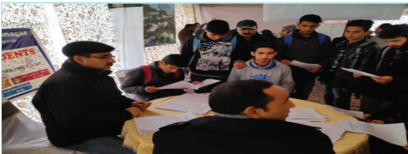
CUS Teachers conducting counselling for the students of Integrated Programmes offered by Cluster University Srinagar.