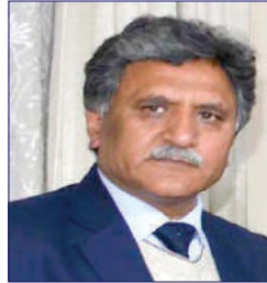
Advisor to Governor Jammu & Kashmir