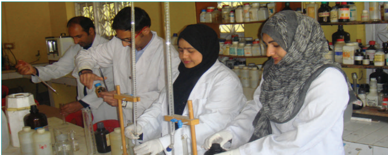
Students busy in their lab activities