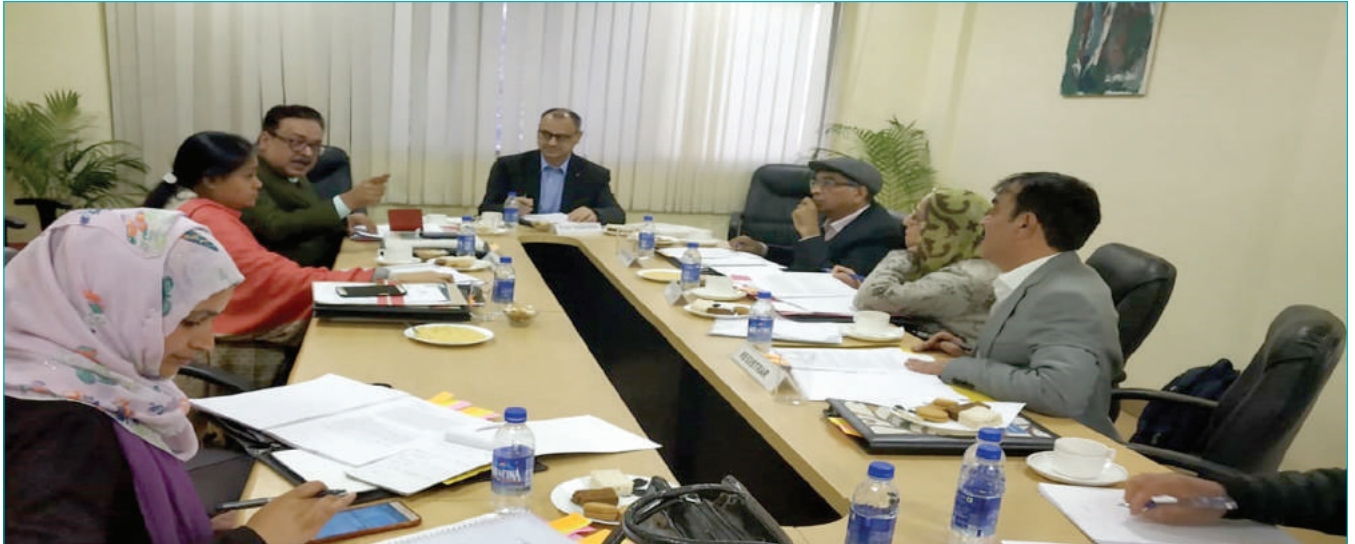
First Finance Committee Meeting on 24th Dec, 2018 to approve Budget Estimates.