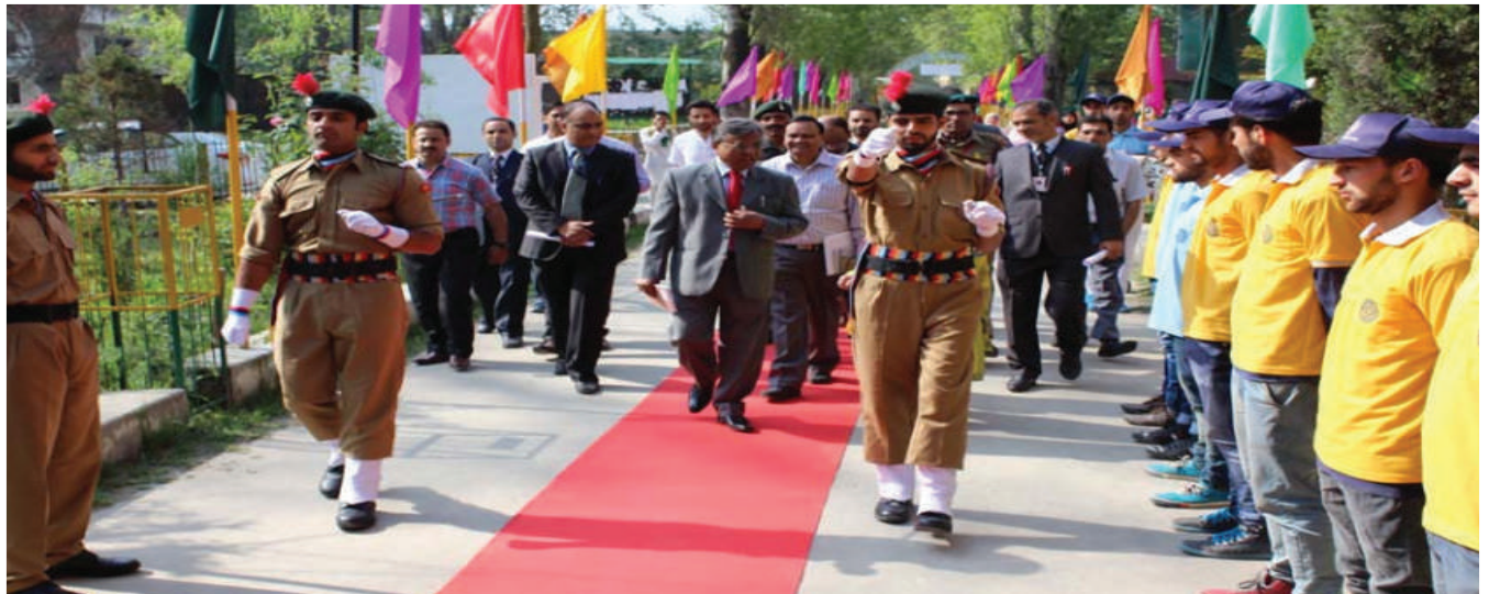
NAAC Accreditation Team approaching SP College Srinagar