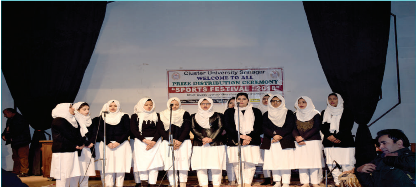
Music students singing to celebrate sports festival

Visuals from 2nd State Universities Sports Championship – 2018