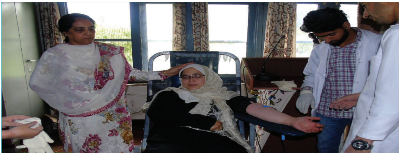
Blood Donation Camp at Addul Ahad Azad Memorial College, Bemina Srinagar

efforts of the department and the organising committee were to provide an amicable ambience, where highly trained resources persons interacted with the students and helped them to overcome their inhibitions and problems in the flow of communication in English.