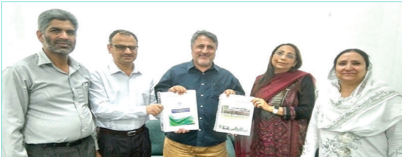
University statutes have been released by Principal Secretary Cum Commissioner Higher Education Department J&K Government.